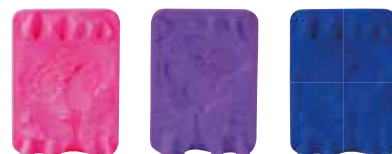
#804 Fuchsia #805 Violet #806 Blue