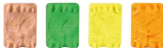
#800 Tan #801 Pistachio #802 Lemon #803 Peach

Available in standard tan color and the exciting new Gelato rainbow of colors!